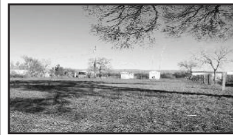
Two lots on East Front St.