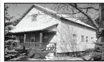
103 N. Walnut