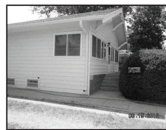
609 S. Howard St.